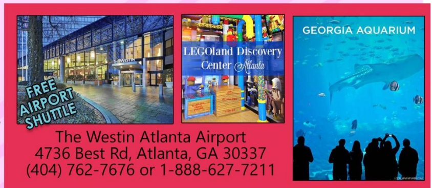
The Westin Atlanta Airport 4736 Best Rd, Atlanta, GA 30337 (404) 762-7676 or 1-888-627-7211

MODELING: Modeling is not judged at all, in any event at AGM.